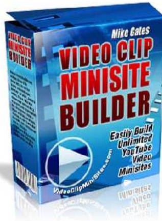
Video Clip Mini-site Builder PLR Software

Video sites are hot and their popularity is sure to explode. People love looking at video clips, and the search engines love video clip websites.