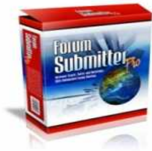
Forum Submitter Pro

All you need to do is decide on your message, choose which forums and sections you wish to post it to and whether you want an instant notification of any replies by e-mail and then pushed the button. Forum Submitter Pro will take it from there.