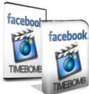
Facebook Video Timebomb

With this product, and it's great information on ramping up your page rank it will walk you, step by step, through the exact process we developed to help people put an end to lack of their WordPress performing the way that it should.