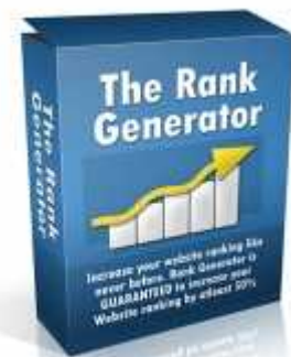
The Rank Generator PLR Software

You Can Easily Add Video To Your Websites Or Even Create Your Own Video Websites In No Time Flat!"