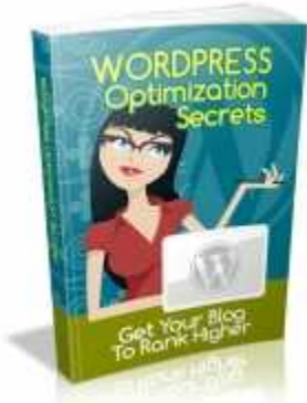
WordPress Optimization Secrets

This powerful tool will provide you with everything you need to know to be a success and achieve your goal of getting top ranking for your WordPress site.