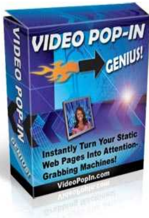
Video Popin Genius PLR Software with Bonuses

This new software will bring new life to your web pages to increase your opt-in rate, improve your sales conversions, and keep visitors on your site longer. It will help you do all of this quickly and easily.