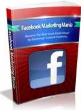
Facebook Marketing Mania

With this product, you'll tap into the basics of using Facebook to market your business effectively.